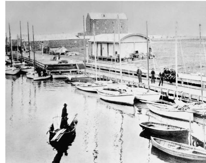
Special thanks to the Port Fairy Branch of the National Trust for their expertise and assistance in the preparation of the Heritage Trails and the Port Fairy Historical Society for the photographs.

20 SARAH LOUISA A brig was lost on 6th July 1849. The full force of a July storm caught the Sarah Louisa as she was about to sail for London fully laden with wheat and tallow. She was driven across the bay, the lifeboat crew were summoned to assist and saved all but two of the crew, the steward and the cook. (Off Connolly Street).