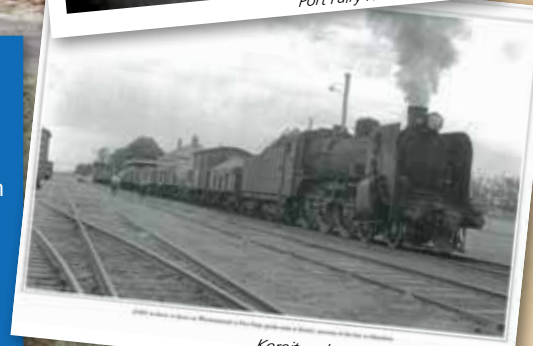
Koroit and District Historical Society