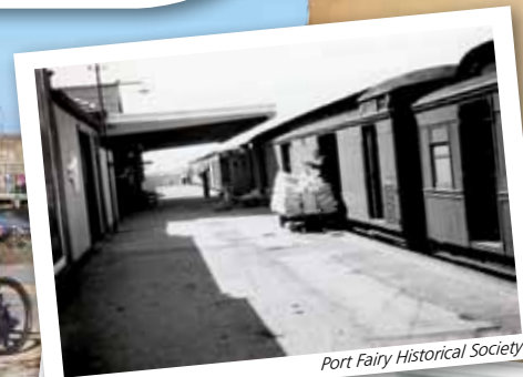
Port Fairy Historical Society

The line closed in September 1977 due to low usage.